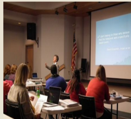
"Echoes & Reflections" Workshop, Huntsville November 2012

The Birmingham Holocaust Education Center (BHEC), in coordination with national organizations such as the U.S. Holocaust Memorial Museum and the Anti-Defamation League, will provide workshops throughout the state. These workshops are designed to enhance teacher knowledge and pedagogy of the Holocaust.